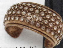
Gypset Multi Row Epoxy Cuff by Lucky Brand, $72; zappos.com