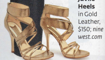
Juvile Heels in Gold Leather, $150; nine west.com