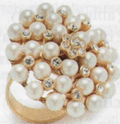
Vintage Cluster Ring , $39; stelladot.com