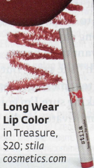
Long Wear Lip Color in Treasure, $20; stila cosmetics.com