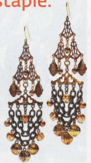
Deco Layered Drop Earrings , $124; patchnyc.com